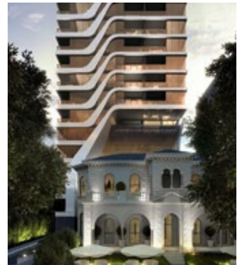
New Charsfield – artist's impression.

The second issue is the weighting given to economic issues. The owner of a listed building can apply for its demolition if she or he can show that maintaining it will cause 'undue financial hardship.' We welcomed a proposal in the position paper to remove this provision, but pointed out: