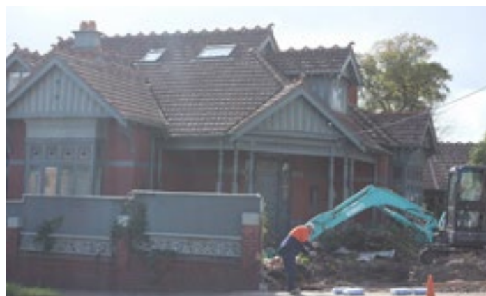
Heritage house faces bulldozer