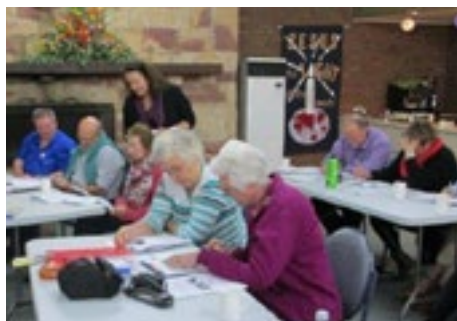
Local historians at work at the recent Hamilton seminar.

If you haven't attended, don't miss the next sessions: Sale (Saturday 17 October, address available on booking) or Melbourne, RHSV Headquarters at the Drill Hall, (Saturday 14 November).