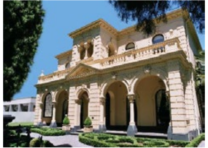
Charsfield, 478 St Kilda Road, in 2014

The Act gives sweeping and unchecked power to the Executive Director in relation not only 'to recommend to the Heritage Council the registration of any place or object or the removal of places and objects from the Heritage Register or the amendment of the Heritage Register' (s. 15 b) but also 'to determine applications for permits and consents under this Act' (s. 15 c). In effect, this makes a politically appointed bureaucrat the ultimate authority determining which applications come before Council and, most importantly, the determining authority for permits to alter or even demolish buildings or objects on the Register. And, while the Act specifies the qualifications of members of Council (s. 7 2 a), it specifies nothing about the Executive Director's qualifications.