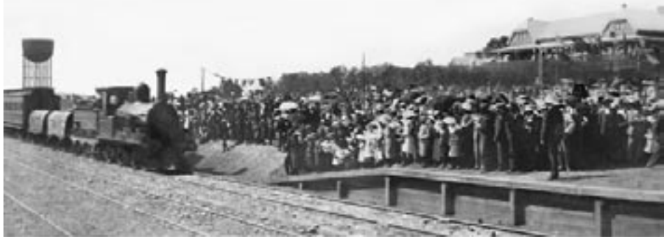
The first passenger train to Mildura arriving on 27 October 1903.

At the time of writing this report, 1600 visitors have visited Making Tracks in Bendigo, with the final long weekend in March still to go!!