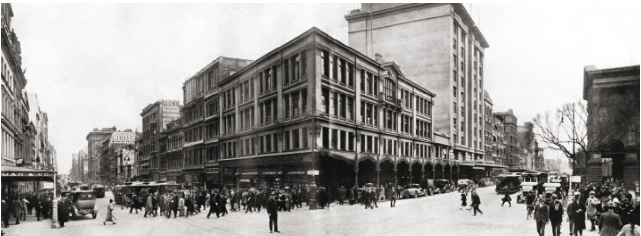
Collins and Swanston streets corner looking west and north c. 1924