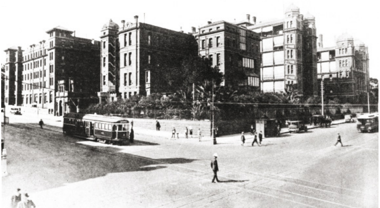
Melbourne Hospital from corner Swanston and Lonsdale streets c. 1929

Charles Nettleton photographer. Courtesy State Library of Victoria H88.22/16