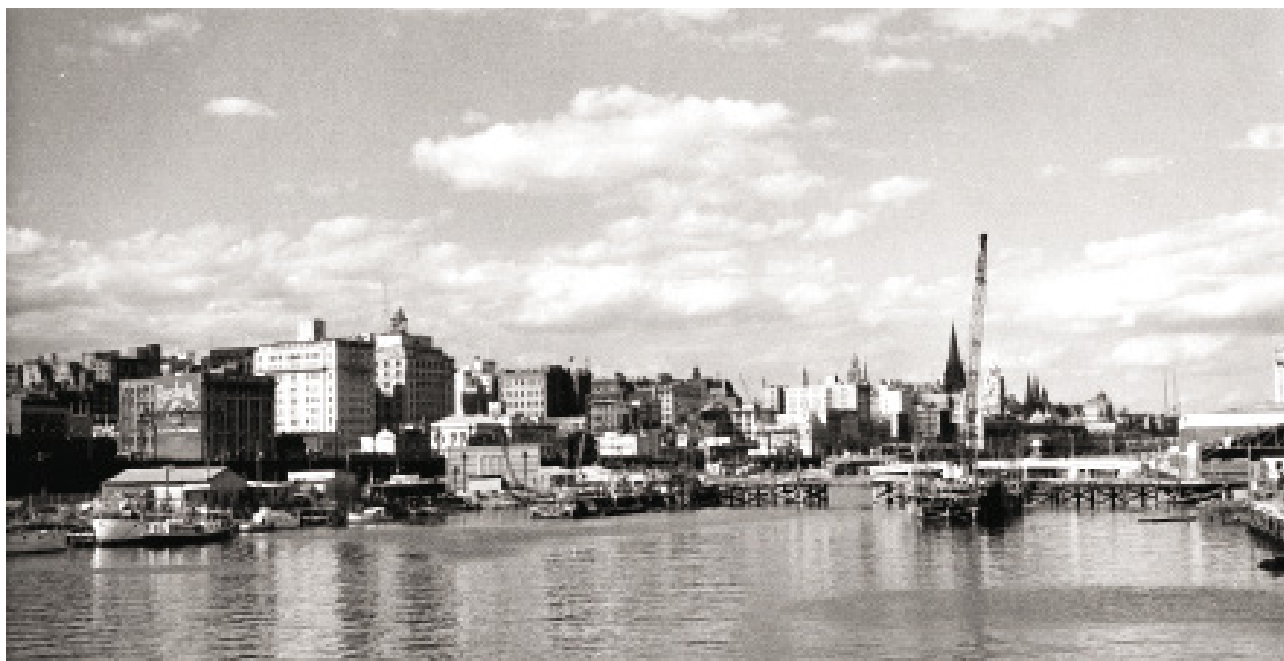
Looking east along the Yarra River, showing city buildings and preliminary work on King Street Bridge, 7 February 1959

Peter Dunbar photographer. RHSV PH-150021