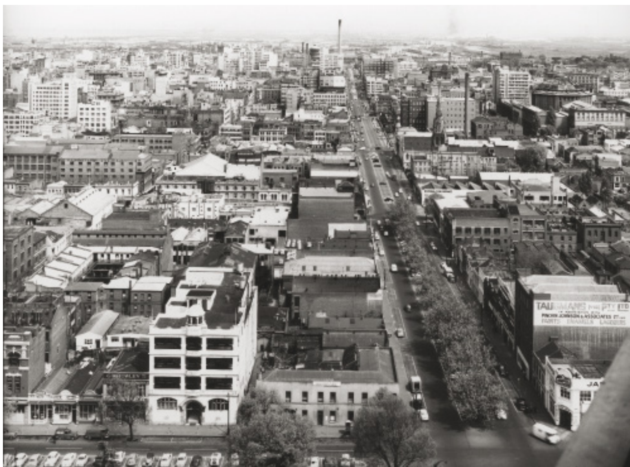
Looking west along Lonsdale Street from intersection with Spring Street c. 1960

Peter Dunbar photographer. RHSV PH-150021