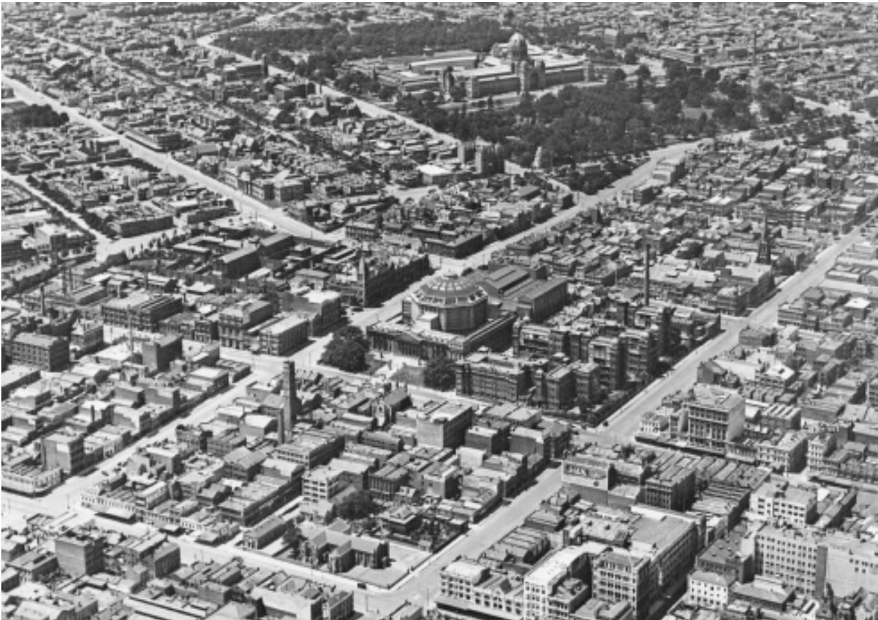
La Trobe and Lonsdale streets c. 1927

Airspy photographer. Courtesy State Library of Victoria H2503