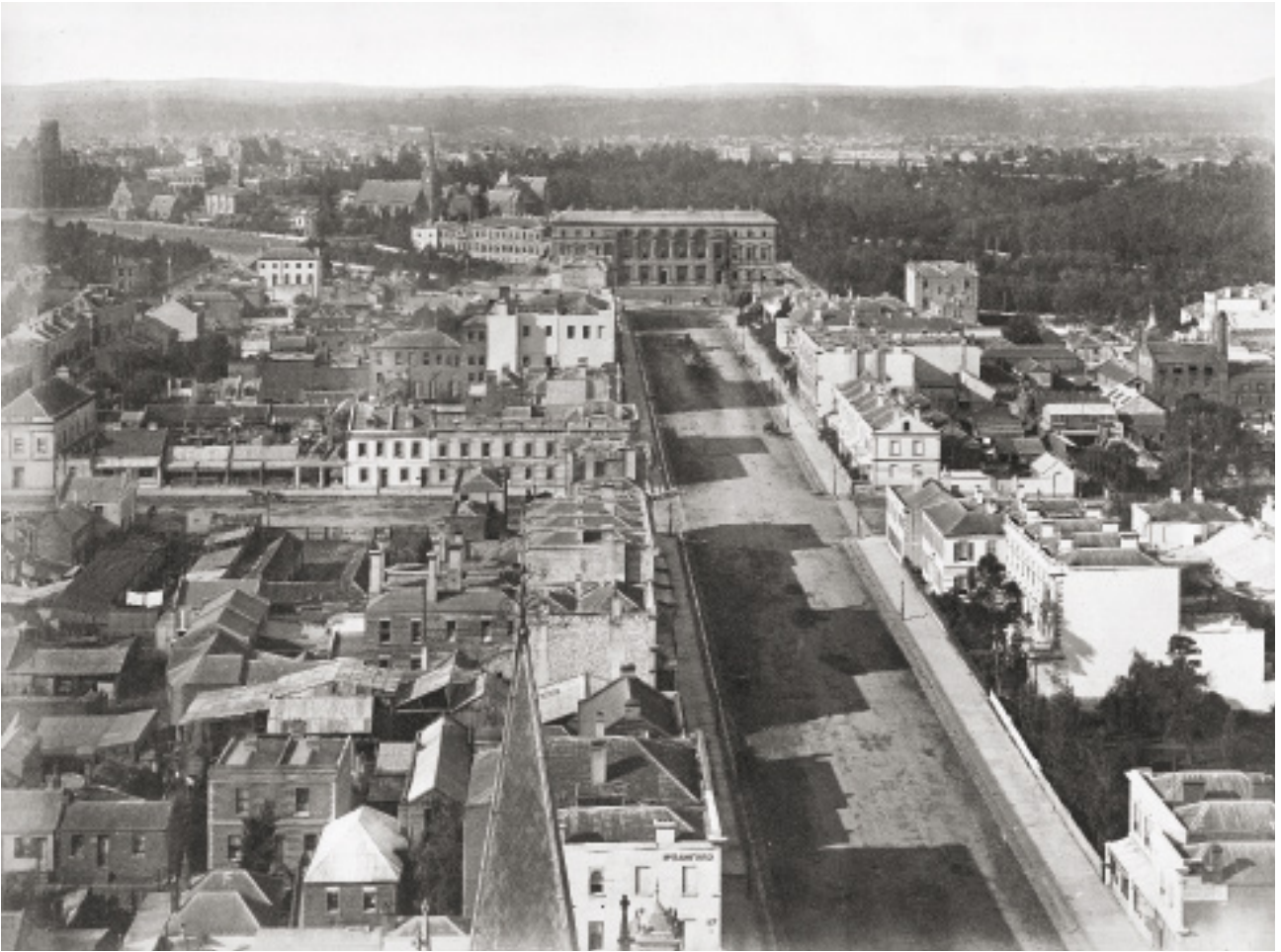
Collins Street panorama 1875

Paterson Brothers photographer. RHSV AL001-0012