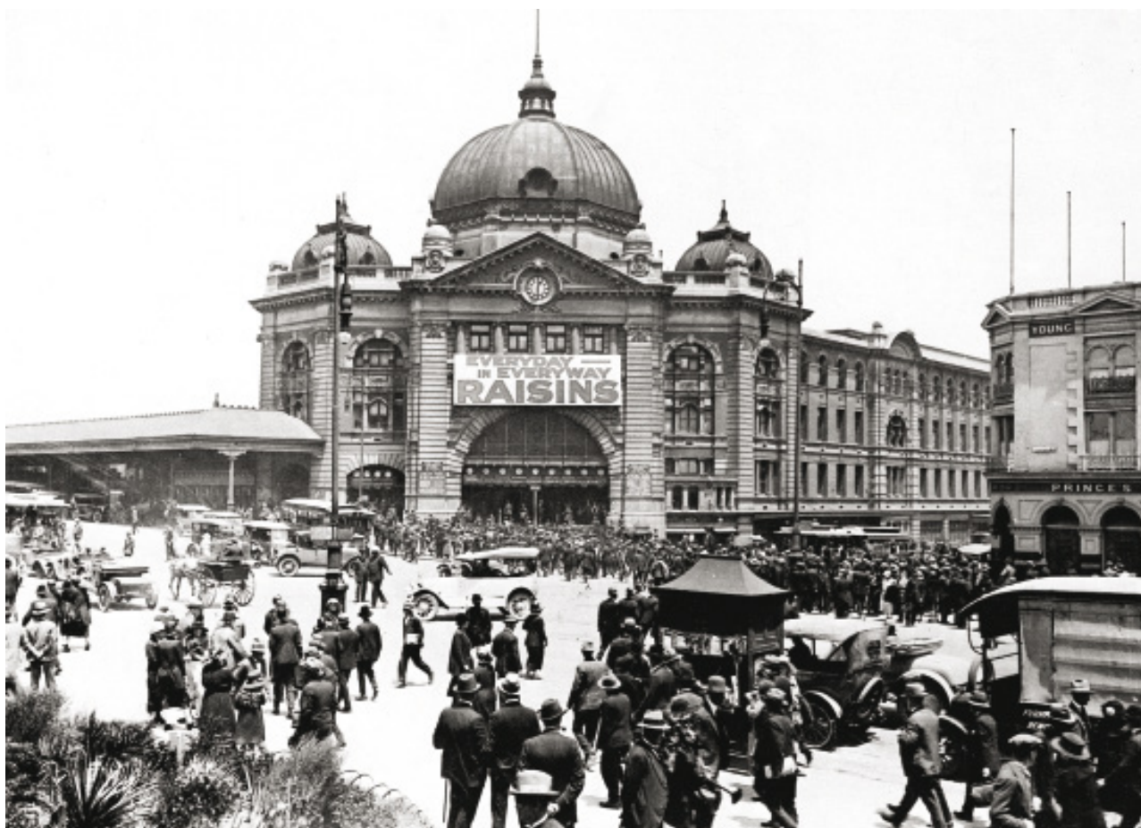
Flinders Street Station entrance c. 1920

the Queen Victoria Market. Professor Sowerwine has led the Committee's engagement with this issue. It involves an incredibly complex and extensive set of Council actions: development of the 'Munro' site immediately south of the market (a 200m tower is proposed); replacing the carpark over the cemetery with a park and a street (New Franklin Street, which will continue Dudley Street through to Franklin Street, leading to Victoria Street); and dismantling the market sheds in order to restore the building materials but also to build underground services and car parking that may compromise the existing functions of the sheds. On 12 October 2016 members of the Committee met with Amy Lees, representing the City of Melbourne. Drawing on this discussion, Professor Sowerwine wrote 'Plans for the Queen Victoria Market: Heritage and High Rise', in November–December 2016 History News . The Committee continues to work on this issue in cooperation with the National Trust and in the interests of conserving the heritage value of the market in accordance with the principles of the Burra Charter and the Australian Heritage Council.