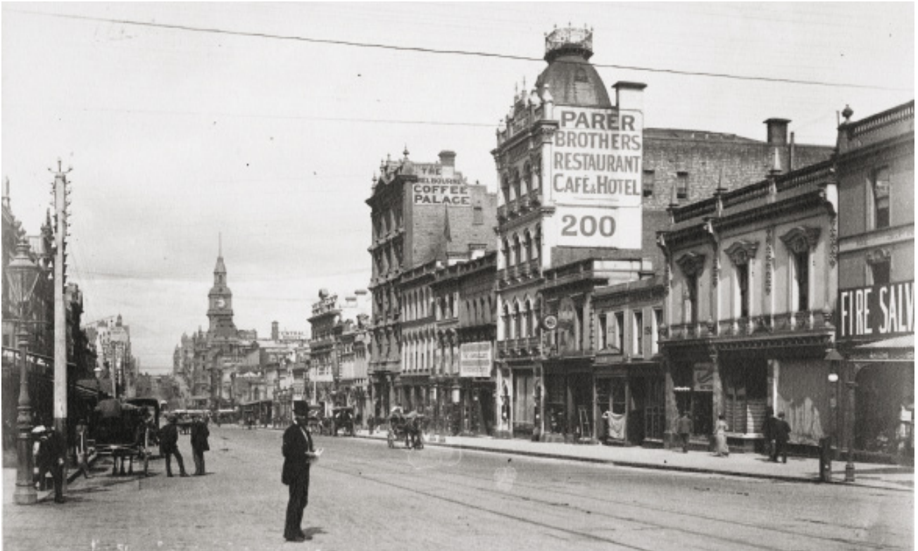
Bourke Street looking west from Russell Street 1899

Henry Cooper Studio photographers. RHSV S-40