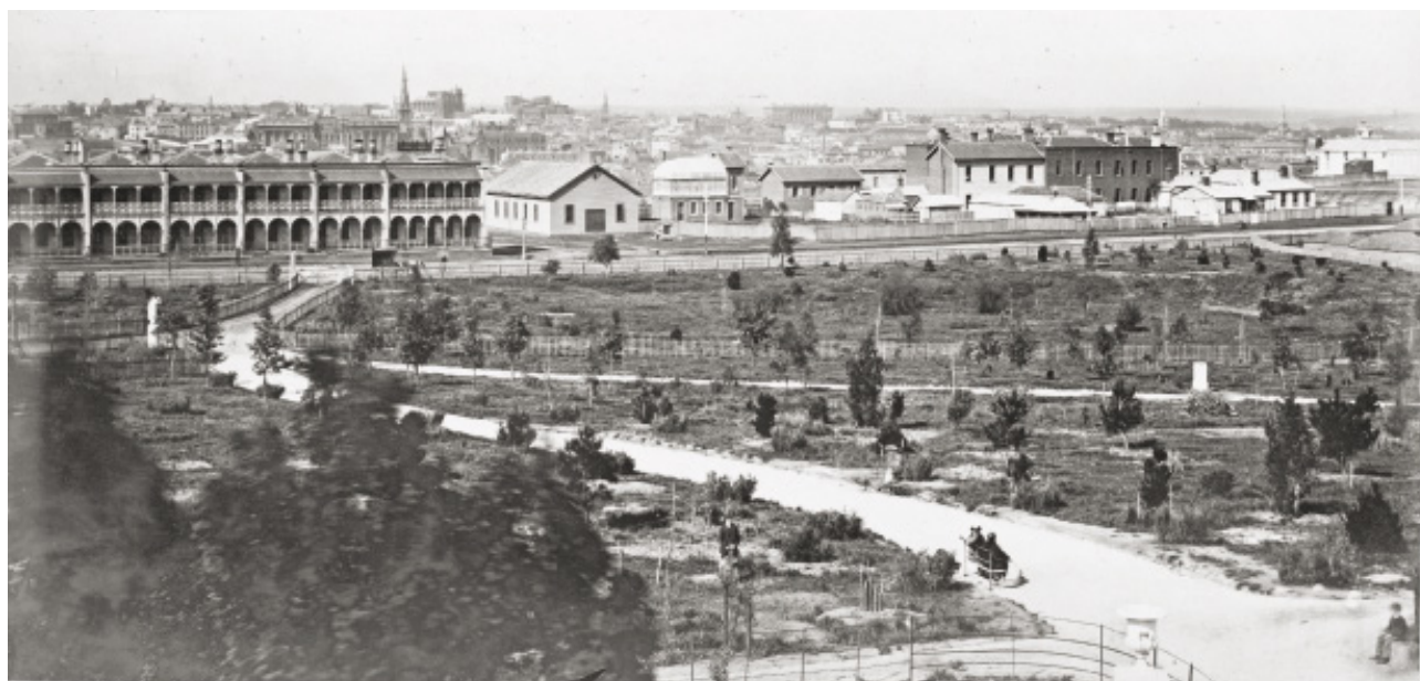
Flagstaff Gardens 1866

G. Attwood, Chemist, 64 Bourke Street, Melbourne, photographer. RHSV D-397.002