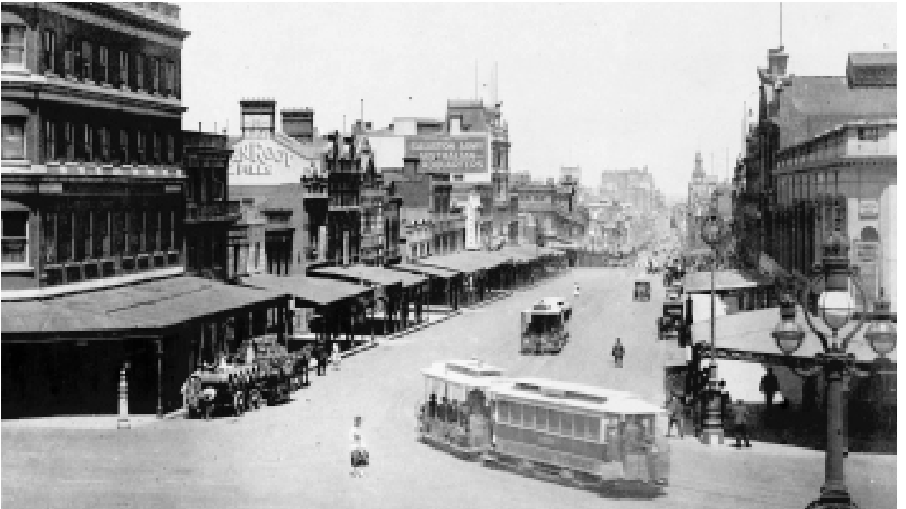
Bourke and Spring streets c. 1910

Henry Cooper Studio photographers. RHSV S-40