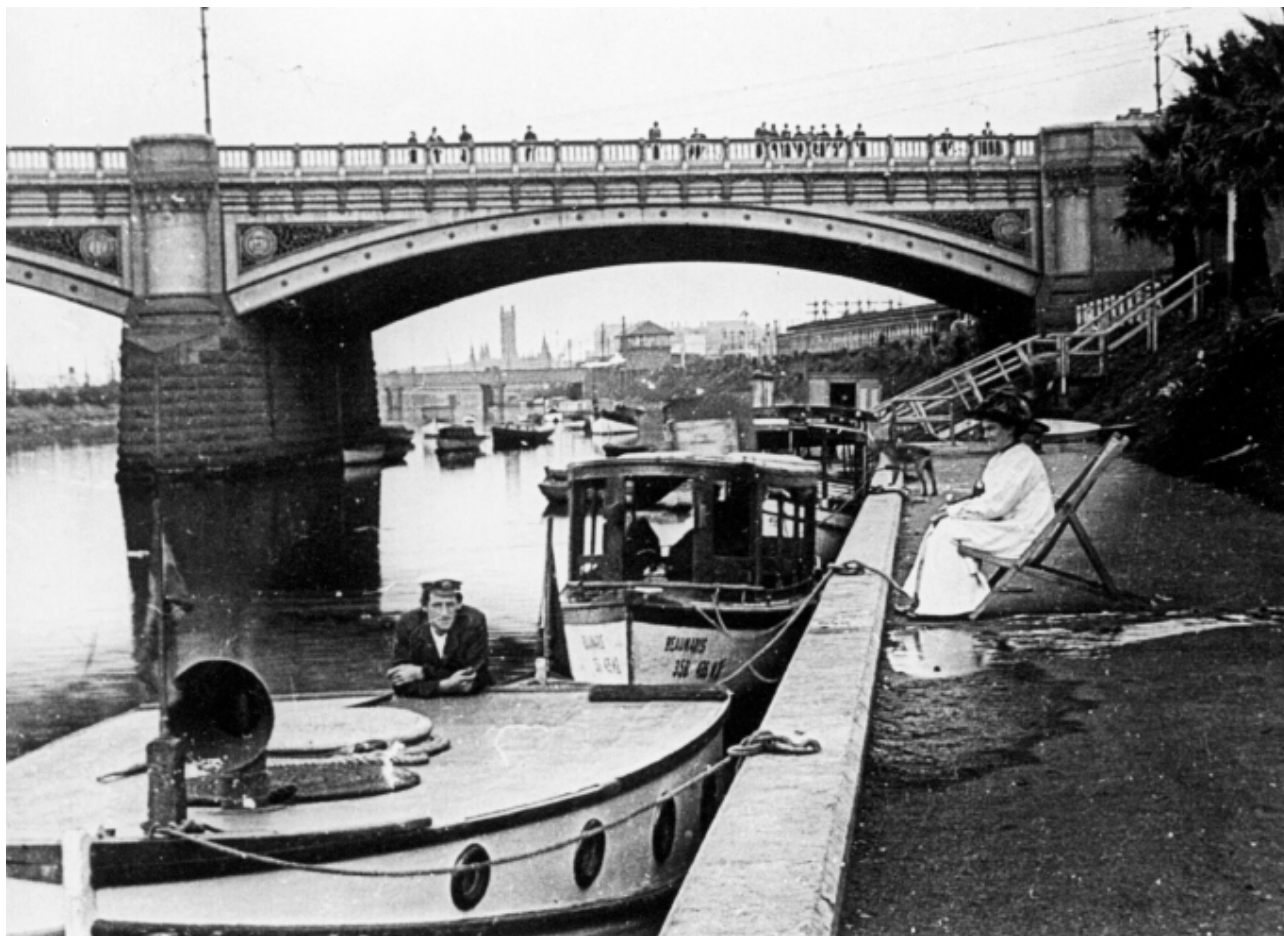
Looking west along Yarra River from below Batman Avenue 1906

G. Attwood, Chemist, 64 Bourke Street, Melbourne, photographer. RHSV D-397.002