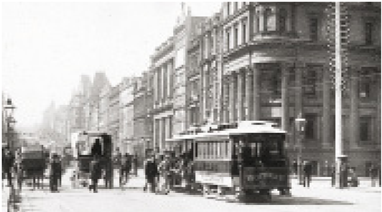
Collins Street looking east from intersection with Elizabeth Street c. 1892

Paterson Brothers photographer. RHSV AL001-0012