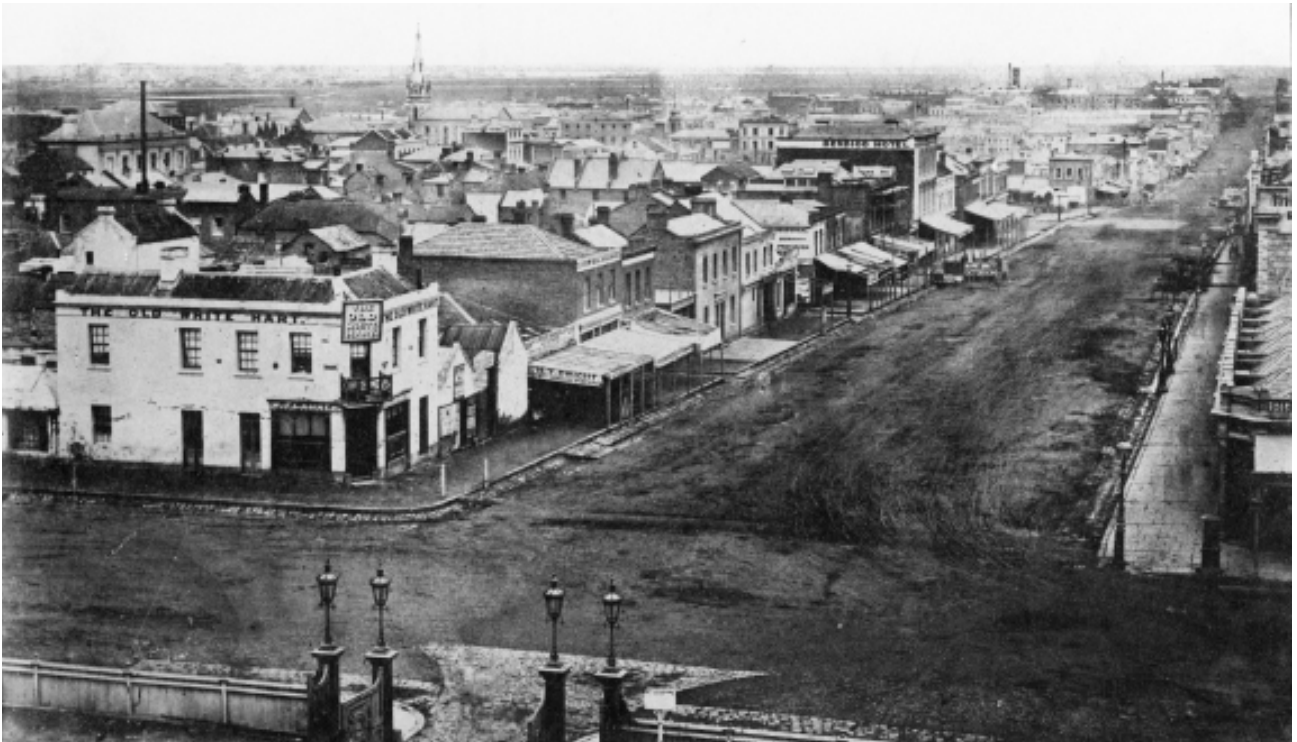
Bourke Street from Spring Street c.1858