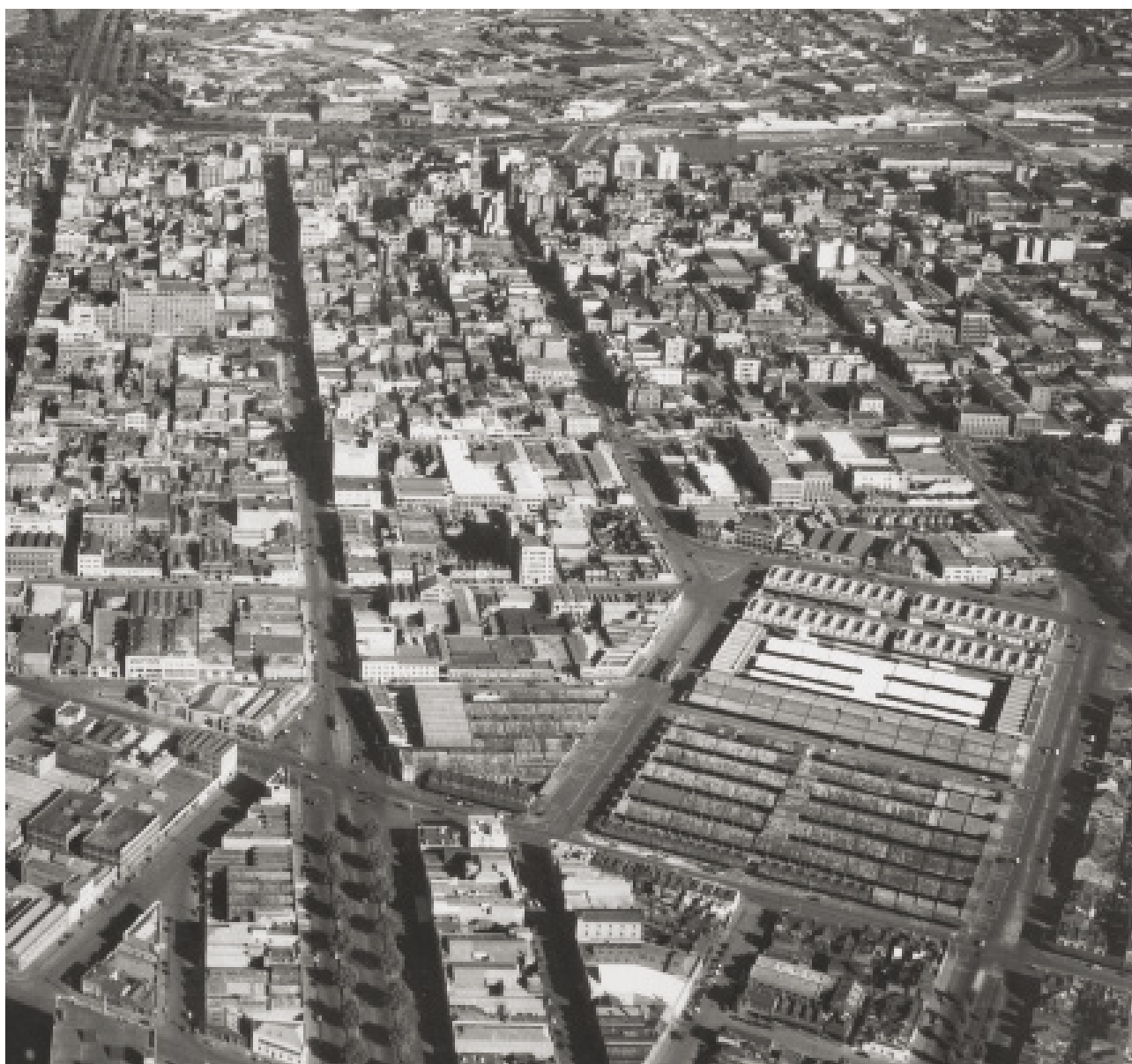
Elizabeth Street looking south from Queensberry Street, Carlton, and showing the Queen Victoria Market, c. 1938