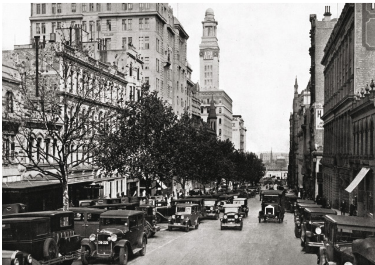
Queen Street looking south from Chancery Lane showing the APA Building c. 1934