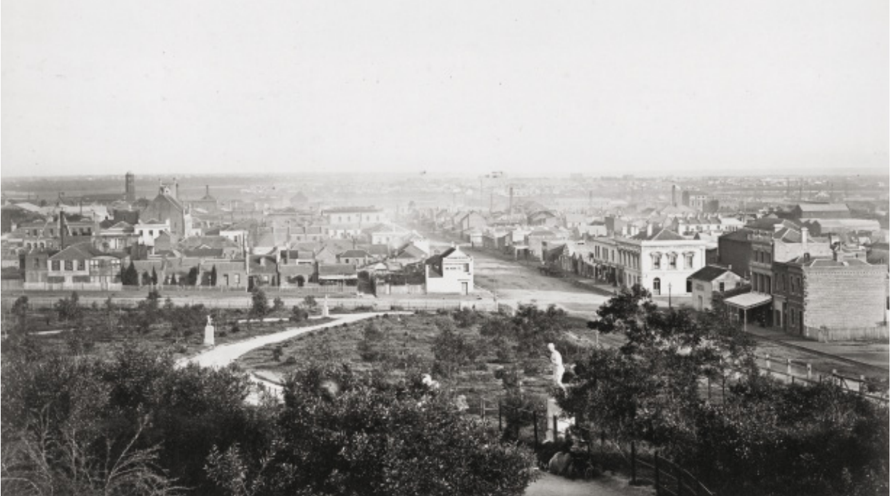
Looking south west from the Observatory, Flagstaff Gardens, to La Trobe Street and its intersection with King Street, 1866

Charles Nettleton photographer. Courtesy State Library of Victoria H88.22/16