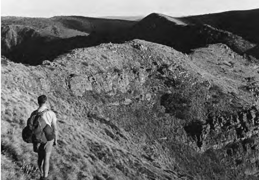
Walking Club excursion, 1914 On the 'Crosscut Saw', a narrow ridge north