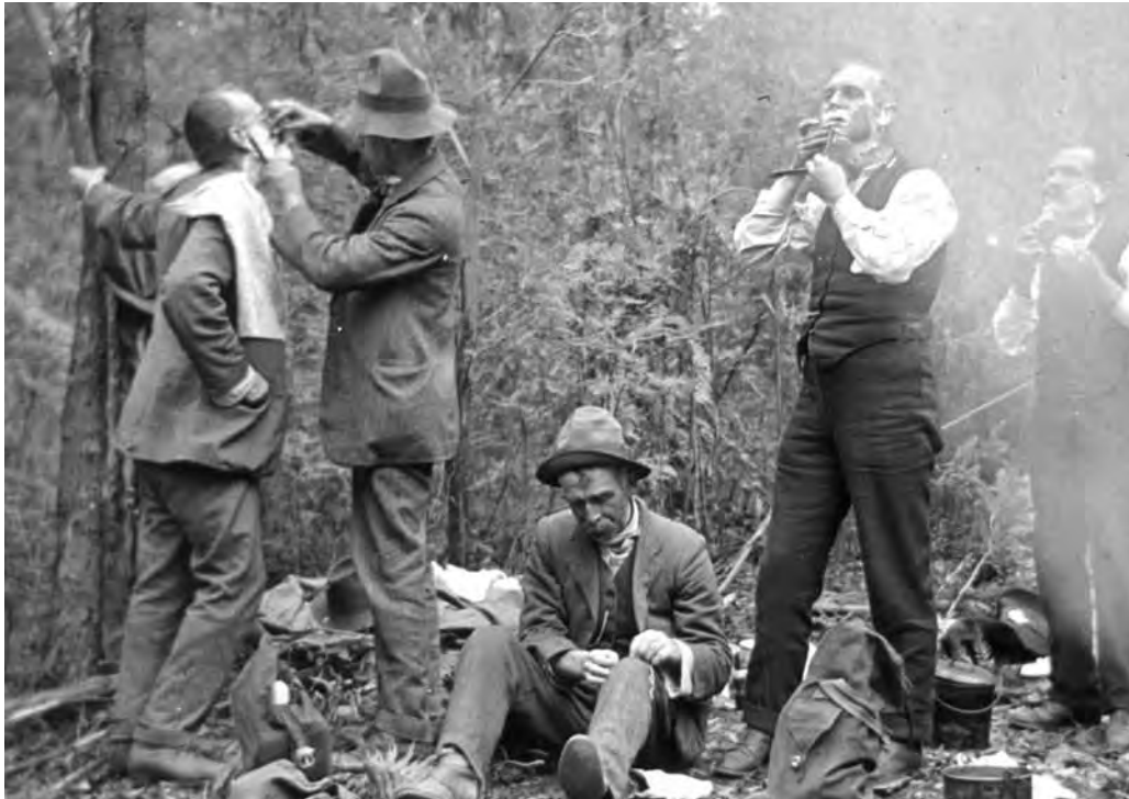
Narbethong, Melbourne Walking Club excursion Crossing the Acheron, Melbourne