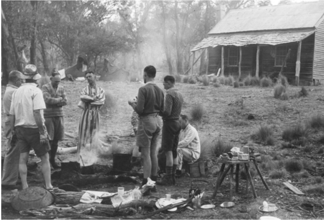
Early morning bushwalker's camp