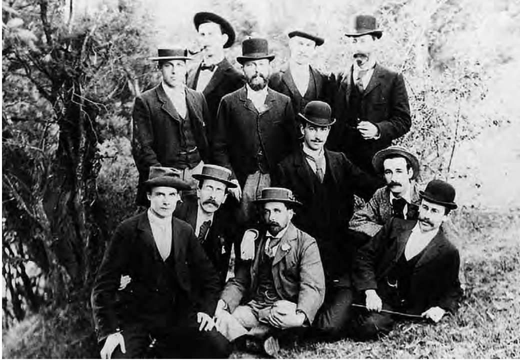
Templestowe Melbourne Walking Club Excursion 1898