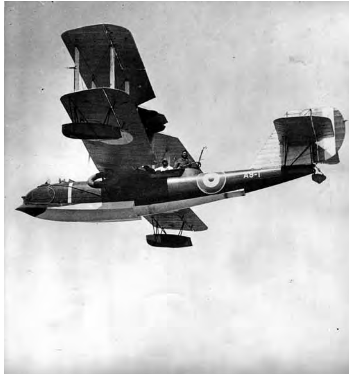
Supermarine Seagull III amphibian aircraft, the first of nine Seagulls operated by the RAAF on behalf of the RAN during the years 1926-1936, photographed in 1926 on its inaugural flight